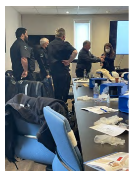
Congratulations on your achievements and thank you all for your dedicated service.